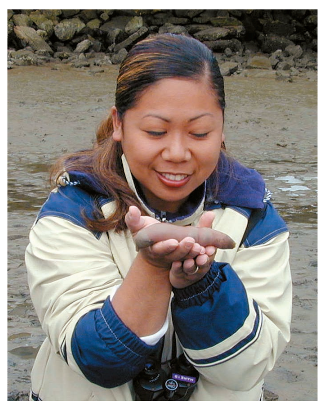
Teacher holding a fat inkeeper worm, illustrating Ocean Literacy concept 5c.

to the discussion, ensuring that the vision of ocean literacy is co-constructed and embraced by the broadest community possible. This nationwide process was initiated in July 2004, when the COSEE Council formally endorsed and acted upon the recommendations of the NMEA Ad Hoc committee charged with addressing the lack of ocean concepts in science standards. Individual COSEE Centers also have made considerable contributions to the Campaign in a variety of ways (see sidebar for examples). Centers contribute copious personnel time for participation in workshops, meetings, and document review.